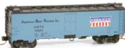
40' Steel Side Ice Reefer with Preco fan ARTX • Rd# 75529 Item# 059 00 540...$25.70