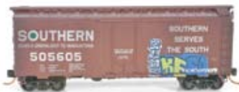
40' Standard Box Car, Plug Door Southern • weathered with graffiti Item# 021 44 100...$21.10