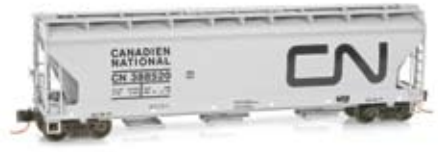
3 Bay ACF Center Flow® Covered Hopper with Elongated Hatches Canadian National • Rd# 388520 Item# 094 00 230...$25.95