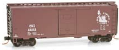
40' Standard Box Car, Single Door Central New Jersey • Rd# 23515 Item# 020 00 846...$17.50