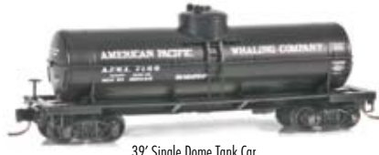
39' Single Dome Tank Car American Pacific • Rd# 7166 Item# 065 00 700...$19.90