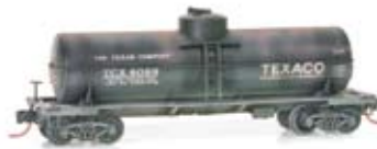
39' Single Dome Tank Car Texaco • weathered Item# 065 44 680...$24.70