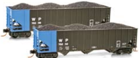
100 Ton 3 Bay Open Hopper, with Rib Sides Western Pacific ® • Rd# 70202 / 70206 Item# 108 00 201...$25.30 • Item# 108 00 202...$25.30