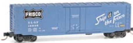
50' Standard Box Car, Plug Door, w/o Roofwalk Saint Louis-San Francisco • Rd# 15535 Item# 038 00 480...$19.75