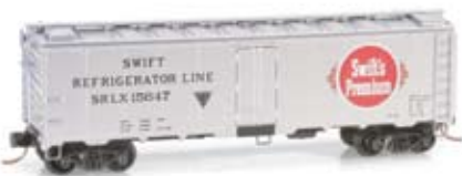
40' Steel Side Ice Reefer Swift • Rd# 15647 Item# 059 00 150...$20.70