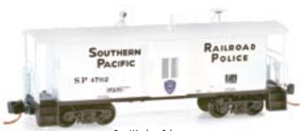
Bay Window Caboose Southern Pacific ® • Rd# 4762 Item# 130 00 070...$28.85