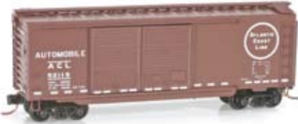
40' Standard Box Car, Double Doors Atlantic Coast Line ® • Rd# 52119 Item# 023 00 320...$19.90