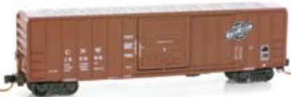
50' Rib Side Box Car, Single Door, w/o Roofwalk Chicago & North Western ® • Rd# 155898 Item# 025 00 710...$20.80