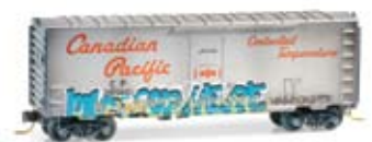
40' Standard Box Car, Plug Door, w/o roofwalk Canadian Pacific • weathered with graffiti Item# 074 44 040...$24.90