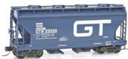
2 Bay ACF Center Flow® Covered Hopper Grand Trunk Western • Rd# 315066 Item# 092 00 010...$22.85