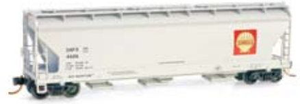
3 Bay ACF Center Flow® Covered Hopper with Elongated Hatches Shell • Rd# 4606 Item# 094 00 210...$26.85