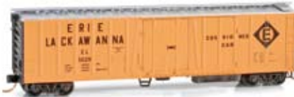
51'3" Rib Side Mechanical Reefer Erie Lackawanna • Rd# 5029 Item# 070 00 020...$25.70