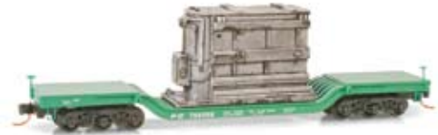
Heavyweight Depressed Center Flat Car Penn Central • Rd# 766058 Item# 109 00 100...$22.35