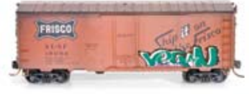
40' Standard Box Car, Plug Door, w/o roofwalk Frisco • weathered with graffiti Item# 074 44 090...$21.40