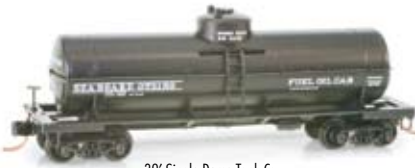
39' Single Dome Tank Car Seaboard Air Line ® • Rd# 073150 Item# 065 00 360...$18.90