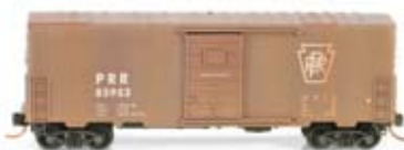
40' Standard Box Car, Single Door w/o Roofwalk Pennsylvania Railroad • Weathered Item# 024 44 180...$22.40