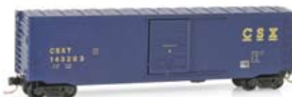
50' Standard Box Car, Single Door, w/o Roofwalk CSX ® • Rd# 143203 Item# 077 00 200...$15.90