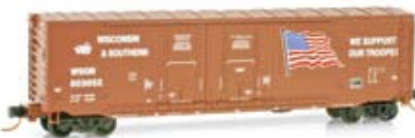
50' Standard Box Car, Double Plug Door, w/o Roofwalk Wisconsin & Southern • Rd# 503052 Item# 075 00 180...$21.30