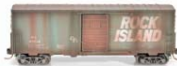
40' Standard Box Car, Single Door w/o roofwalk Rock Island • weathered Item# 024 44 270...$18.60